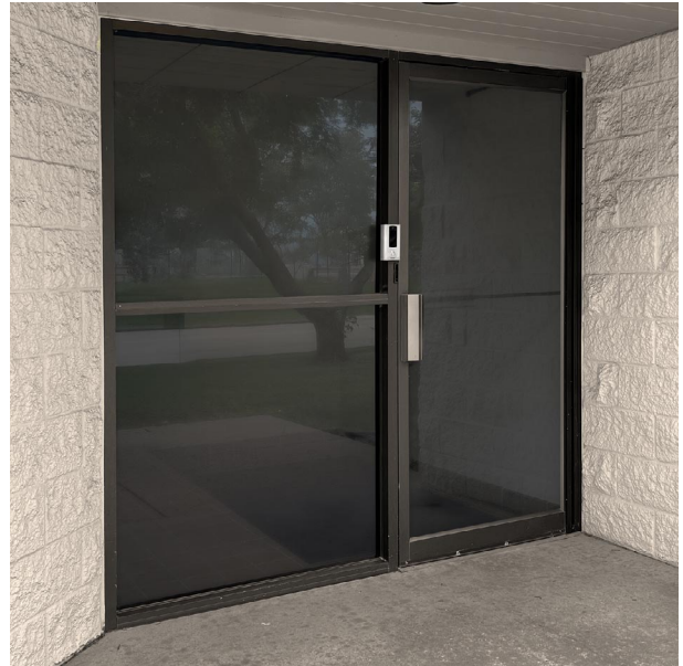
Picture above shows a Viking model X-205-SS mounted to a vertical window mullion using the X-205-MMK mounting plate.