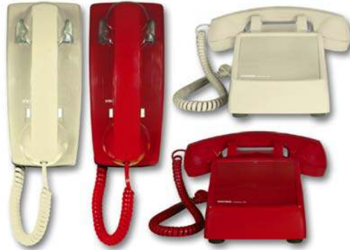
K-1500P-W Ash / Red