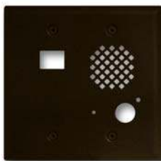
PNL65-BN (Oil Rubbed Bronze)