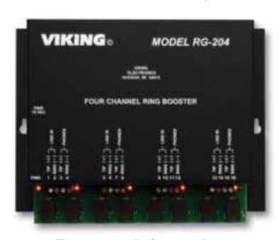
For more information, see DOD# 417

The RG-204 ring generator is designed to reshape and increase the ringing power of up to 4 analog PABX extensions, FXS ports, IP phone system analog ports, or any other telecom devices which provides ringing.