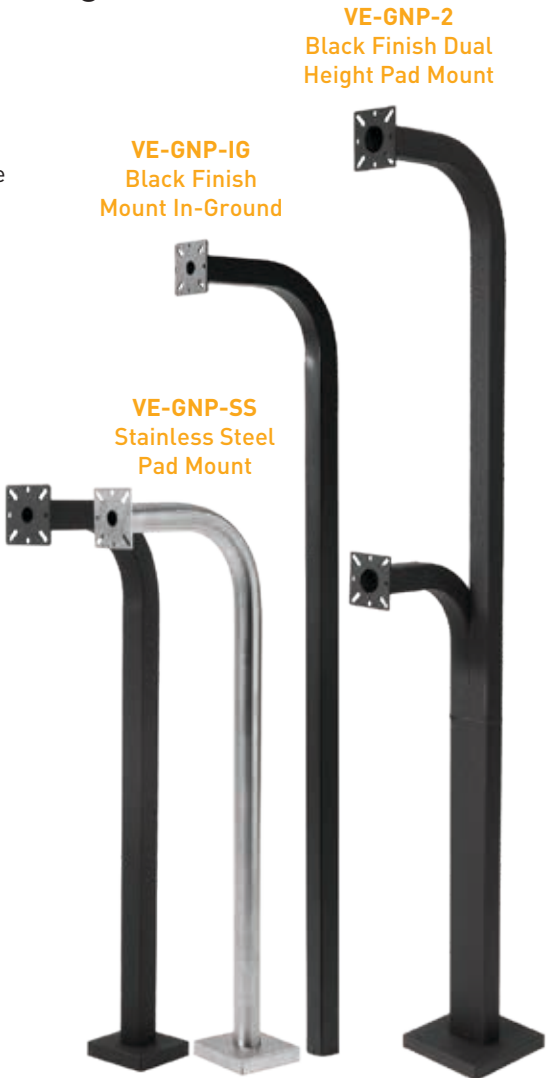
VE-GNP-2 Black Finish Dual Height Pad Mount

Viking pedestals are designed to be used with VE-Series Surface Mount Boxes. Check out the large selection of surface mount boxes, on page 3.