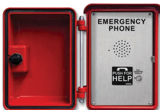
E-1600-912A emergency phone shown mounted in a VE-9x12R-0P enclosure (sold separately)